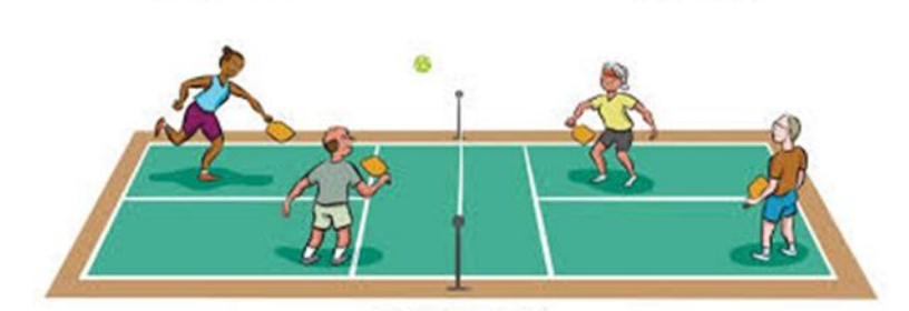
Interested in Pickleball?

Small stuffed animals or something soft to hold